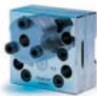
Single-outlet port Spinning Pump, rectangular design

High Fashion Flowing Apparel: Viscose and Polyester Silk made with Feinpruef Spinning Pumps by Mahr Metering Systems