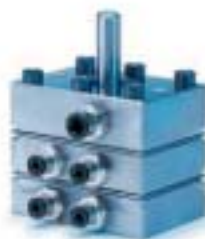
Four-outlet port Spin Finish Pump