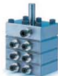
Spin Finish Metering Pump with six-outlet ports