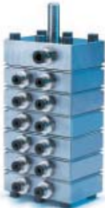
Twelve-outlet port Spin Finish Pump