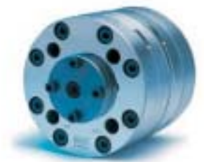
Multiple-outlet port Spinning Pump, planetary design