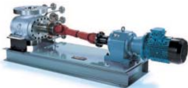
Ready-to-install system for Discharge Pump

Our comprehensive Pump range also includes an entire program of state-of-the-art measuring technology developed by Mahr. If you are looking for reliable, cost-effective Metering Equipment for the kind of consistent quality you need to keep your customers satisfied, look to Feinpruef Technology by Mahr Metering Systems. Call us for further information – we'll be glad to help.