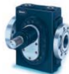
Pressure Increase Pump with double jacket