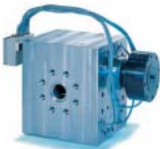
Pressure Increase Pump with electric heating elements

Feinpruef Spinning Pumps by Mahr Metering Systems excel with the ultimate in precision, wear, corrosion and temperature resi-