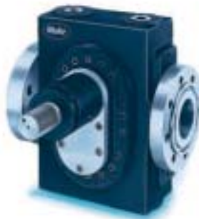
Pressure Increase Pump double jacketed for liquid heating/cooling