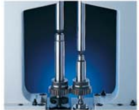
Mahr measuring technology checking the quality of gearwheels in Spinning Pumps

If you are looking for complete, ready-to-install systems rather than single components for your production, Mahr Metering Systems has the answer for you. Our experts will give you comprehensive advice and will compile preconfigured Pump packages to suit your needs. For example, we can deliver Metering or Vacuum Discharge Pumps, electrically or liquid heated, including mounting, safety coupling, coupling guard, gear motor with mechanical or inverter speed control and, if required by your production process, with pressure control and control box.