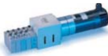
Spin Finish Metering Pump with drive

* This is just a selection from our complete range of Pumps. Please call us and let us know your operating conditions. Our project engineers will give you detailed advice and suggest a solution that best meets your needs. Detailed leaflets are available on request. These printed specifications are for informational purposes only. Mahr Metering Systems reserves the right to make technical changes. Copyright reserved.