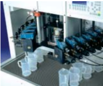
Discharge and pressure test on Test Stand