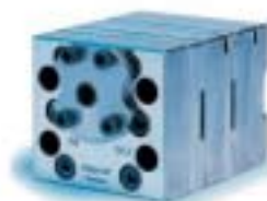
Multiple-outlet port Spinning Pump, rectangular design