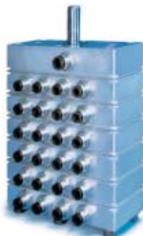
Twentyfour-outlet port Spin Finish Pump