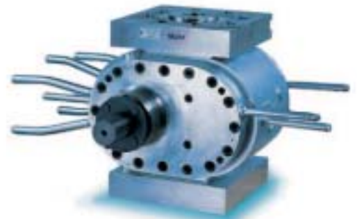
Vacuum Discharge Pump double jacketed for liquid heating/cooling