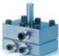
Double-outlet port Spin Finish Pump