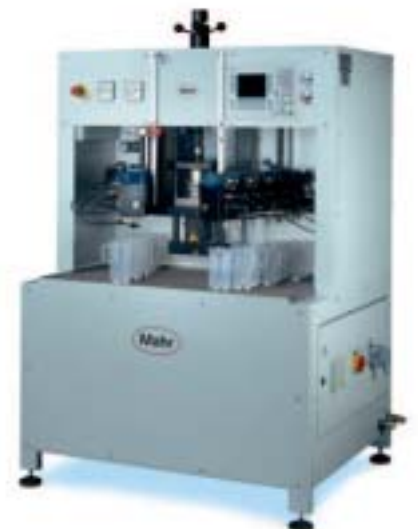
Test Stand for twelve-outlet port Spinning Pumps

a preset counter-pressure. The delivered flow rate of the discharge ports is then measured under various differential pressures and precisely documented. For increased testing accuracy, the test is carried out under defined conditions with a low-viscosity silicone oil (e.g. 0.5 Pascal). All other testing conditions remain constant while the discharge pressure is adjusted to the correct differential pressure. The fluid metered through the Pump is collected and weighed. Evaluation of these measurements gives the two vital Pump values needed to assure the discharge quality: the "metering accuracy" and the "delivery deviation" of the Pump discharge ports at various differential pressures. These results give you the certainty that everything is running the way your production process requires.