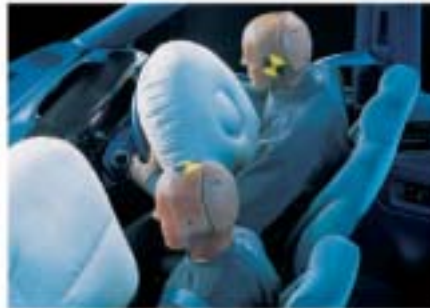
Safety hangs on strong threads: Feinpruef Spinning Pumps by Mahr Metering Systems produce thread for airbags.

of your product. This ensures that you receive precisely the Spinning Pump required and guarantees constant product quality and maximum reliability.