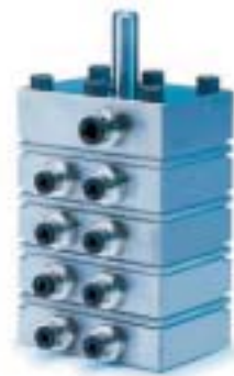
Eight-outlet port Spin Finish Pump