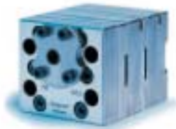
Double-outlet port Spinning Pump