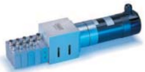
Drive Unit with Spin Finish Pump