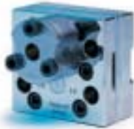
Single-outlet port Spinning Pump