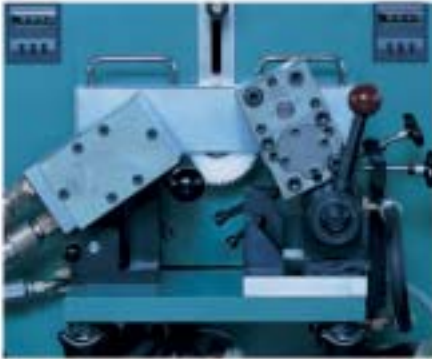
Discharge test of Spinning Pumps by Mahr Metering Systems